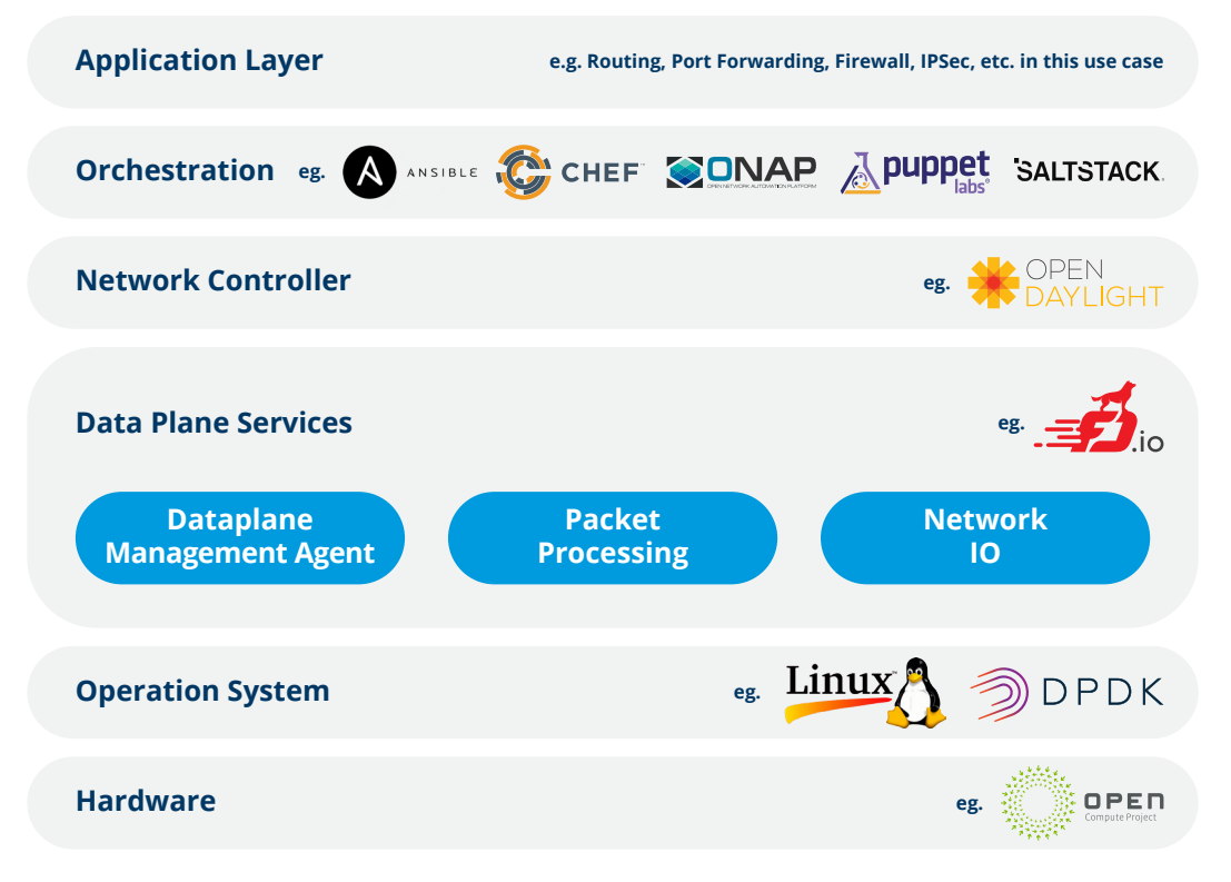
Figure 2 FD.io in the overall cloud stack

Figure 2 below describes how FD.io fits in the broader ecosystem of open source networking and computing initiatives.